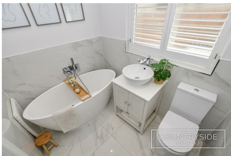
Bathroom 7'0" x 5'7" (2.13m x 1.70m)

Upvc windows to front and side aspect, coved smooth plastered ceiling, carpet, partly panelled walls, radiator, power points.